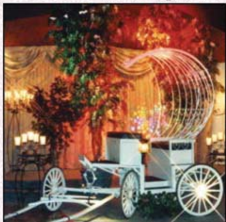
Magical Fairy-Tale Coach

Limo Service to and from Red Rock (Driver waits for you) • 12 Rose Bouquet Boutonniere • 36 Poses & Proofs Viewed On-line • Toasting Glasses 10 Candid Photos (taken during ceremony) Includes Minister's Fee Photographer Videographer. Does not include Live Webcast. Must be booked 2 weeks in advance. $900.00 plus $190.00 Park Permit Fee