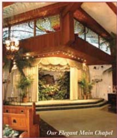
Our Elegant Main Chapel