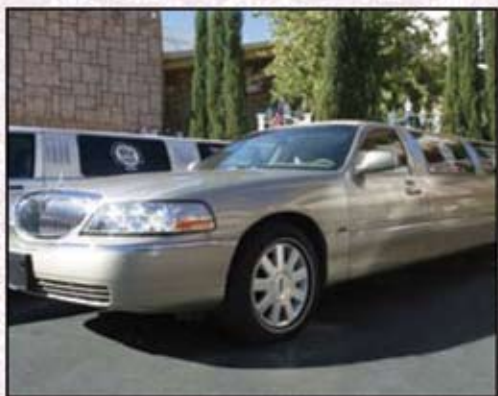
Ultra Super-Stretch Limousine – Seats 8 People