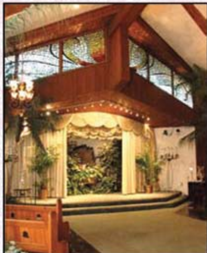
Our Elegant Main Chapel