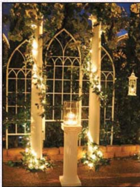
The Garden Wedding Chapel - Evening

Our Weddings are Live on the Internet for FREE!