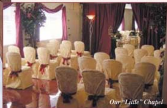
Our "Little" Chapel