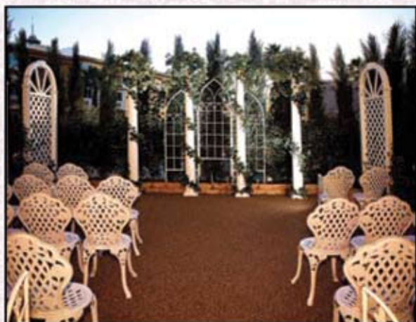
The Garden Wedding Chapel