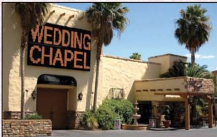
Authentic Mission-Style Chapel